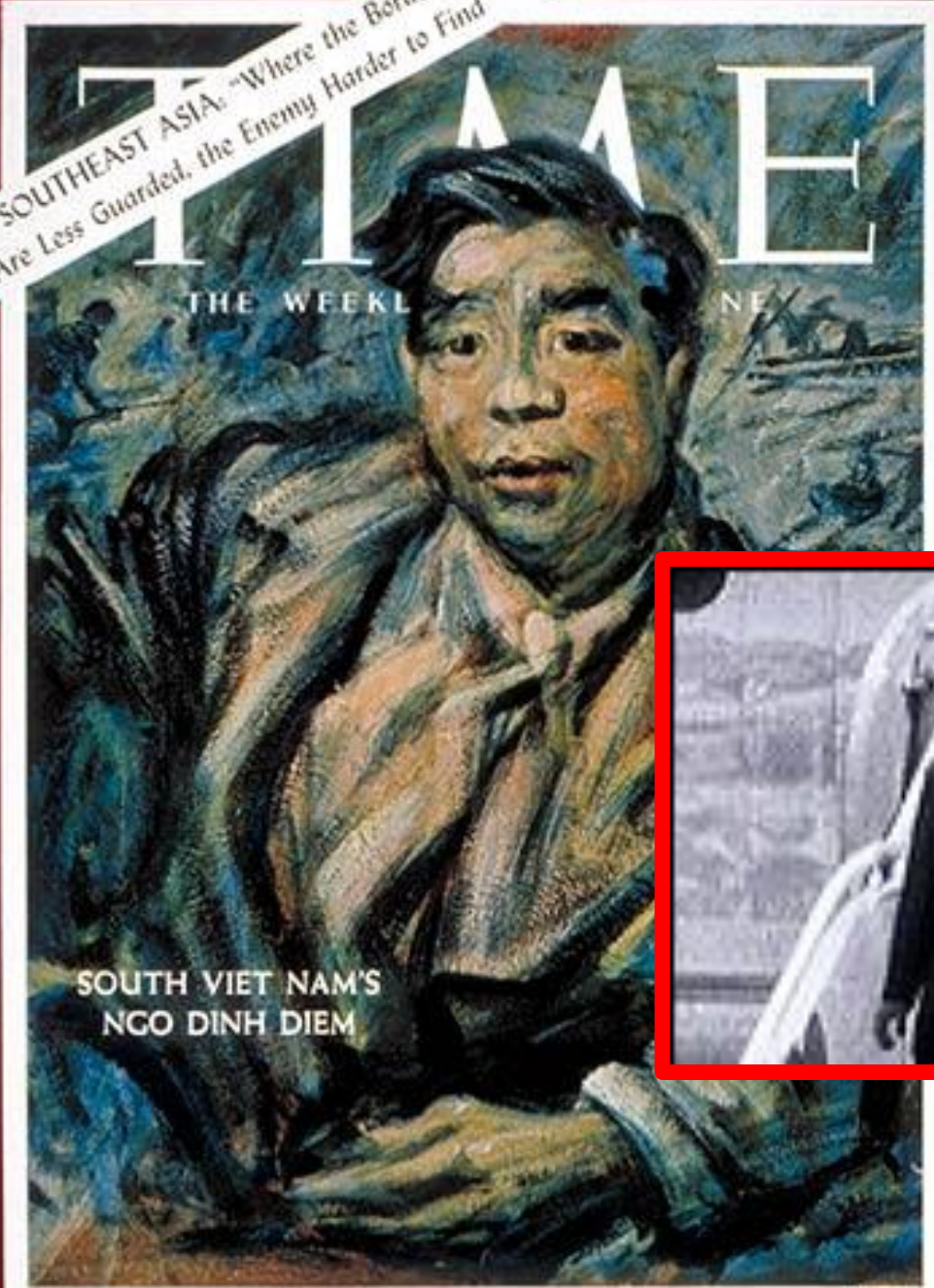
SOUTH VIET NAM'S NGO DINH DIEM

SOUTHEAST ASIA: "Where the Borders Are Less Guarded, the Enemy Harder to Find"