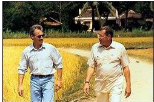
Colburn, left, and Thompson return to meet the children of My Lai in 1998. "He's the real hero," Colburn says of the pilot, who put his body in the line of fire and confronted higher-ranking officers to save villagers.

A million things were going through my mind. The first thing, I wanted no one to think I was going to raise an M60 machine gun and draw on them. Or they'd draw on us. I remember pointing my muzzle straight at the ground so there'd be no mistake. We had a little staredown but I caught one guy's eye and I kinda waved, thinking, hey, fellow American, and he waved back.